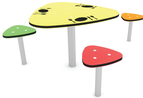
TABLE WITH SEATS